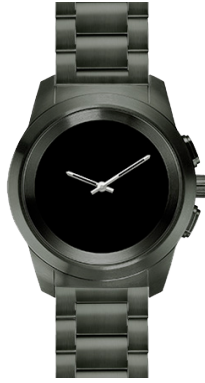
Black Metal Link