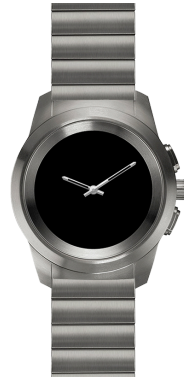
Titanium Modern Link