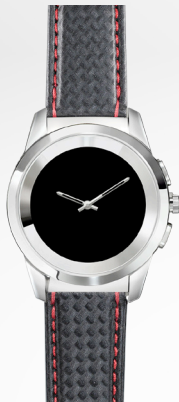
Carbon red stitching