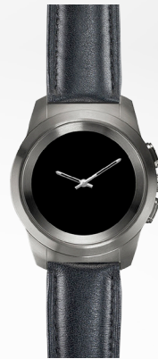
Black Flat Leather