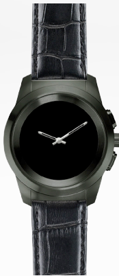
Black Embossed Leather