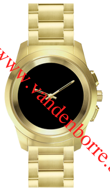
Gold Metal Link