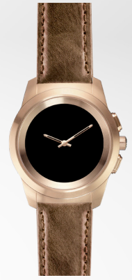
Brown Vintage Leather

Box size: 10.4*14 cm Box weight: 321.4 gr Packing (20 pcs per carton) Master carton size: 57.7*23.8*30 cm Master carton weight: 7,3 kg